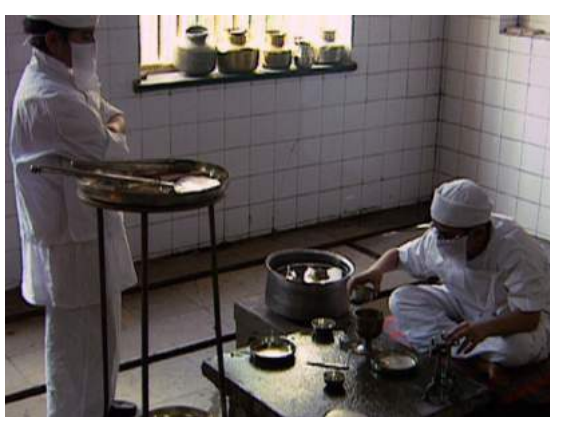
Soma-Sacrifice in a school for Zarathustra-Priests, Mumbai/India