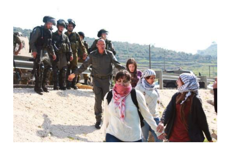
Nabi Saleh, Westbank 2013